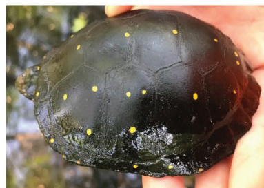
Spotted Turtle – Jacob Spain