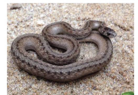
Northern Brown Snake - Chris Petersen

The killing of wildlife, including snakes, is prohibited!