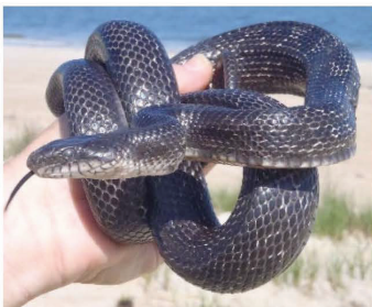
Black Rat Snake - Lindsay Eiser