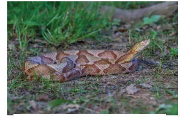
Copperhead

The other, the cottonmouth, or water moccasin, is rarer, only having been seen twice on Fort Lee in the last 10 years, both times along the Appomattox River.