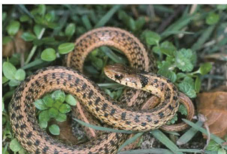
Garter Snake- Chris Petersen

More common species are the docile black rat snake and its similar, but faster and smoother, black racer. Often found in gardens are the common garter and northern brown snakes.