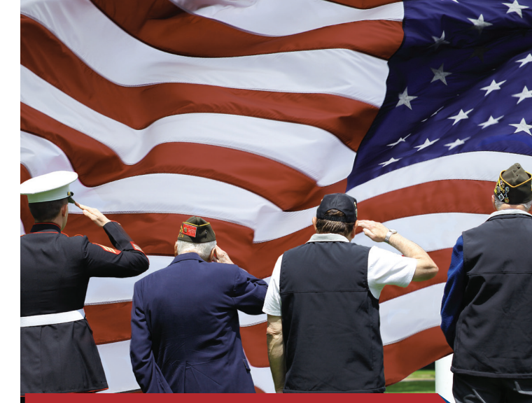
NOVEMBER IS NATIONAL VETERANS AND MILITARY FAMILIES MONTH